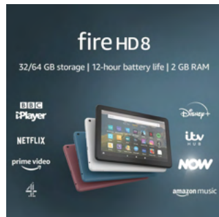
Fire HD 8 Tablet, 8" HD display